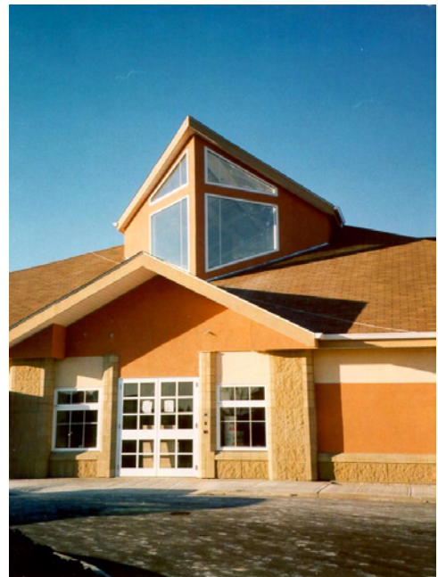
Southminster-Steinhauer United Church