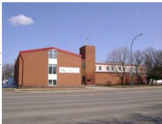
Knox United Church in Brandon, Manitoba

ago to explore the possibility of becoming affirming, we were aware that we were the first church in Brandon to do so. A few members accepted the responsibility of leading the process of discussion and dialogue as well as surveying and gauging the feelings of the congregation. Several concrete actions were realized. For example, to address